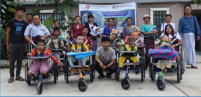
Recipients and caregivers pose with BCMF staff at a wheelchair mission in Nay Pyi Taw Union Territory.