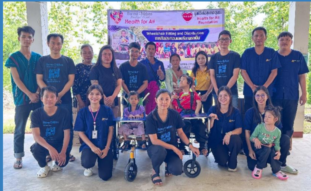
Recipients and caregivers pose with the BCMF team after a fitting mission at Umphang Special Education Centre.

In Burma, BCMF successfully expanded the wheelchair project to Nay Pyi Taw in Burma, fitting 29 recipients with wheelchairs and providing training for 5 local staff members.