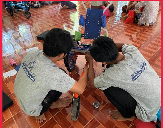
The BCMF team assembles a wheelchair donated by Wheelchairs for Kids at a wheelchair fitting mission in Burma.

Additionally, due to safety concerns, the team was only able to travel to Yangon Division, Mandalay Division, and Nay Pyi Taw Union Territory for wheelchair distribution and training missions in Burma. However, demand for mobility devices is urgent across the entire country.