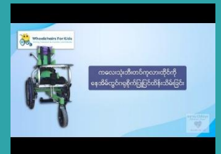
Burmese Instructional Video