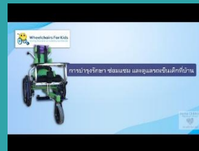
Thai Instructional Video